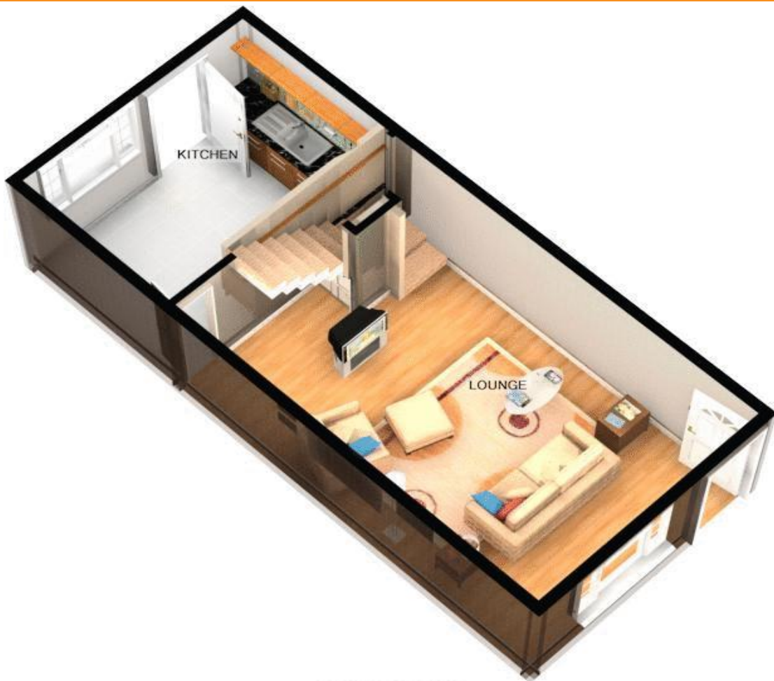
GROUND FLOOR APPROX. FLOOR AREA 339 SQ.FT. (31.5 SQ.M.)