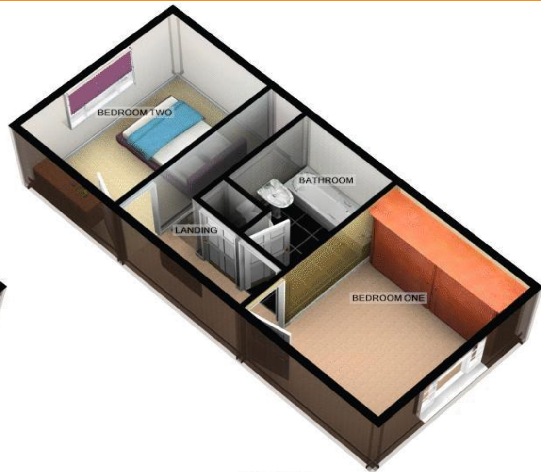
1ST FLOOR APPROX. FLOOR AREA 338 SQ.FT. (31.4 SQ.M.)

TOTAL APPROX. FLOOR AREA 676 SQ.FT. (62.8 SQ.M.)