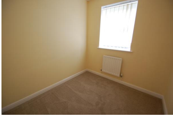
Bedroom 3 - 7' 3" x 7' 0" (2.21m x 2.13m)