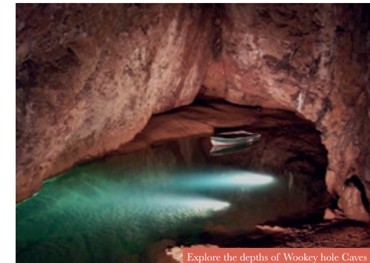
Explore the depths of Wookey hole Caves