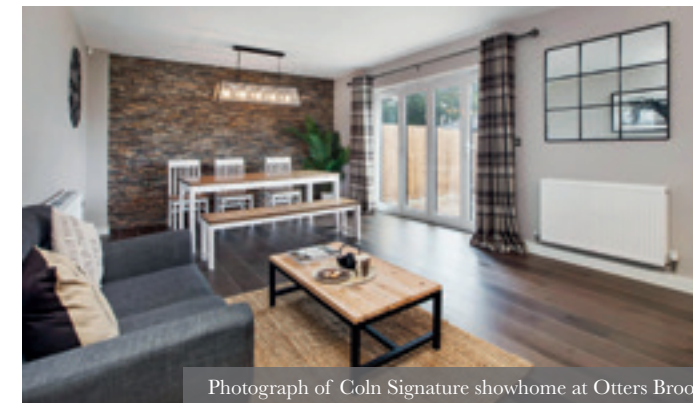
Photograph of Coln Signature showhome at Otters Brook