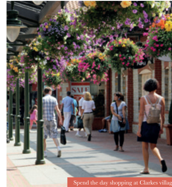
Spend the day shopping at Clarkes village

Berrow Golf Course or take long strolls along the beach and soak in the views. Explore the nearby wildlife and leisure park with the family which boasts lakes and a play area. The town itself has many restaurants and cafés to dine in and a few good family pubs. There are many shops and supermarkets easily accessible on the outskirts of Burnham. Other amenities such as a doctors surgery, dentist practice, bakery and fishmongers can also be found within the town.