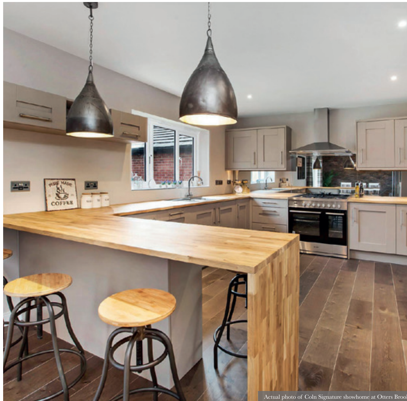
Actual photo of Coln Signature showhome at Otters Brook

Photograph may contain optional extras - please speak to the sales consultant for further details