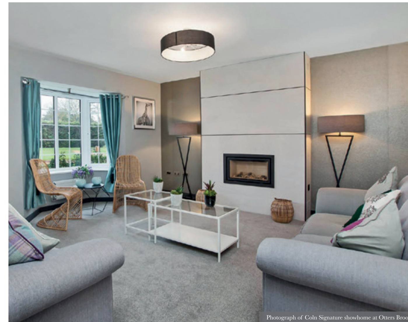
Photograph of Coln Signature showhome at Otters Brook