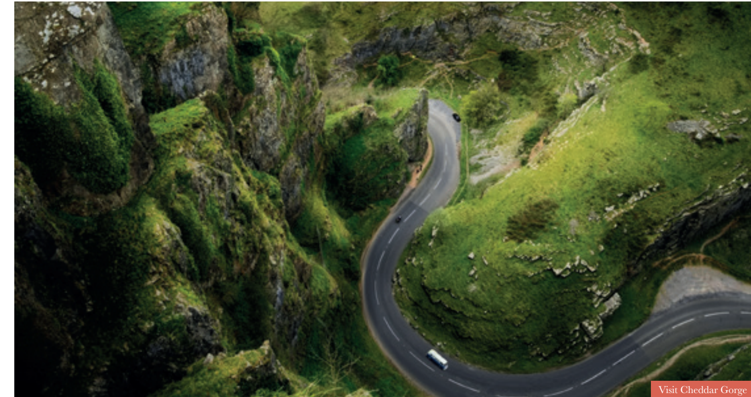
Visit Cheddar Gorge

Just 16.5 miles away is Clarkes Village. Indulge yourself in a shopping spree and a bite to eat at this popular destination. The vast range of outlet shops would be a great place to pick up a few bargains and furnishings for your new home.