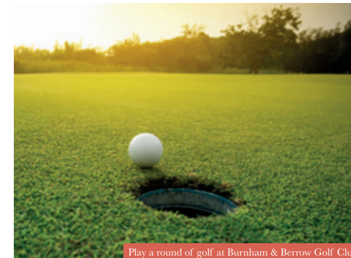
Play a round of golf at Burnham &amp; Berrow Golf Club