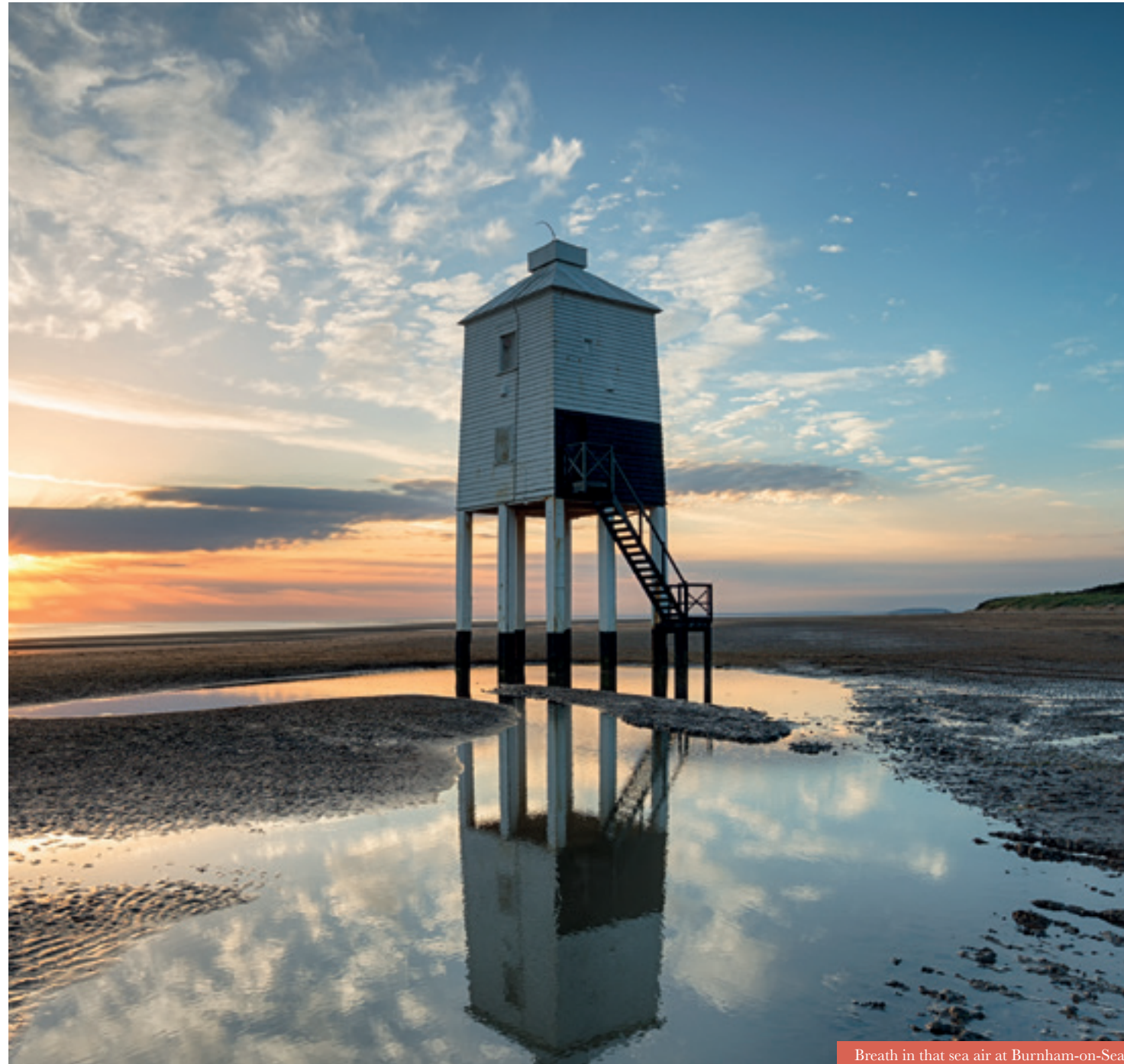
Breathe in that sea air at Burnham-on-Sea